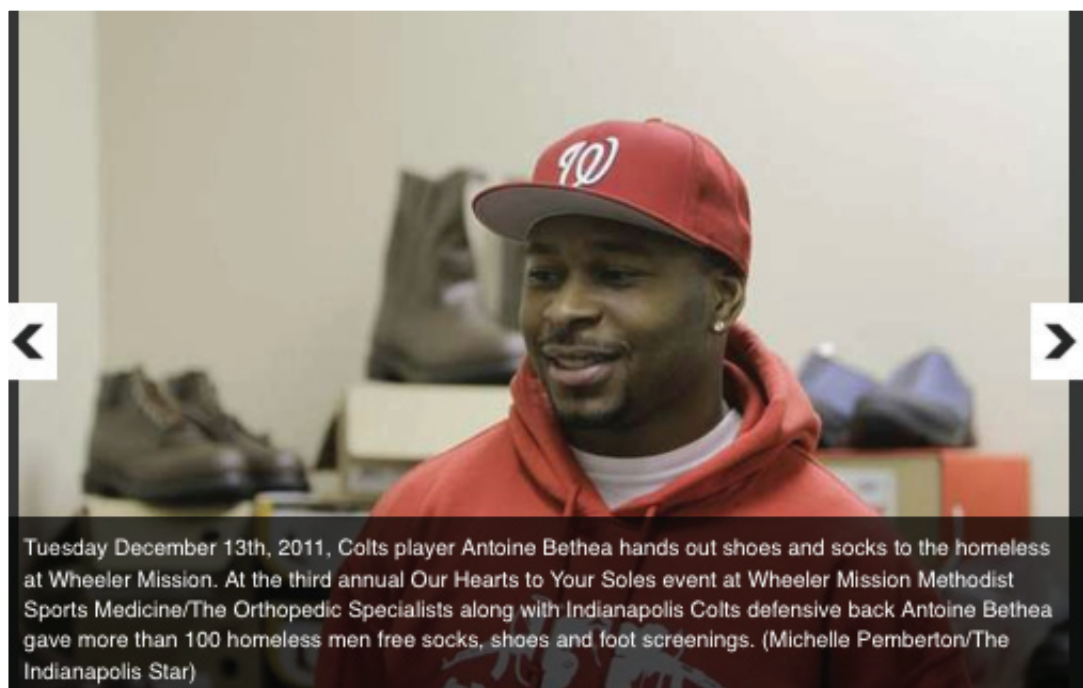
Tuesday December 13th, 2011, Colts player Antoine Bethea hands out shoes and socks to the homeless at Wheeler Mission. At the third annual Our Hearts to Your Soles event at Wheeler Mission Methodist Sports Medicine/The Orthopedic Specialists along with Indianapolis Colts defensive back Antoine Bethea gave more than 100 homeless men free socks, shoes and foot screenings.